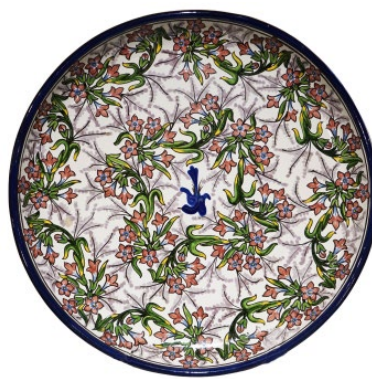
Figure 3. Aguila Studio, Talavera Pottery, 20th century; Former Convent of Santa Rosa Collection