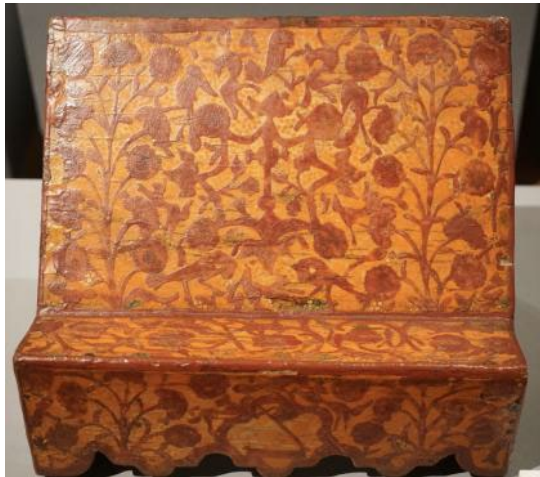
Figure 5. Lacquer Artwork “Guerrero,” Mexico, circa 1760; Franz Mayer Museum Collection