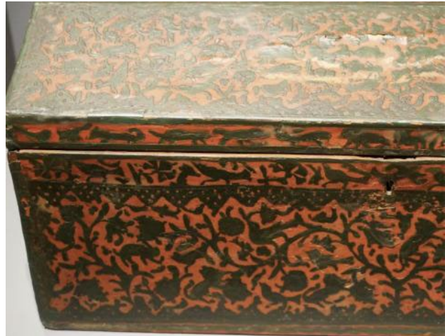
Figure 6. Traditional Lacquer Storage Chest, Guerrero, Mexico, circa 1800-1900; Franz Mayer Museum Collection