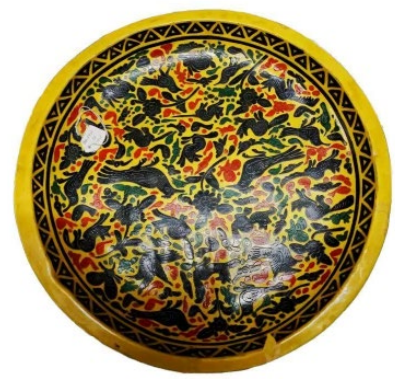
Figure 4. Traditional Lacquer Bird Motif Plate, 20th Century; Franz Mayer Museum Collection

(edited by Huamin Wang, photographed by Fan Liu)