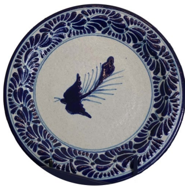
Figure 2. Contemporary Products from Uriarte Talavera Workshop

Today, Talavera blue-and-white pottery from Puebla—Mexico's renowned ceramic hub—is ubiquitous in markets across the country. During a visit to a leading Talavera workshop earlier this year, staff explained their commitment to preserving tradition ( Figure 2, Figure 3, Figure 4, Figure 5, Figure 6 ). This tradition encompasses both time-honored techniques [16] and classic motifs, among which avian designs dominate. The emphasis on avian symbolism is not unique to this workshop. In fact, since the early 20th century, contemporary ceramists dedicated to revitalizing Talavera traditions have consistently featured bird motifs as one of the most frequently recurring patterns in their works.