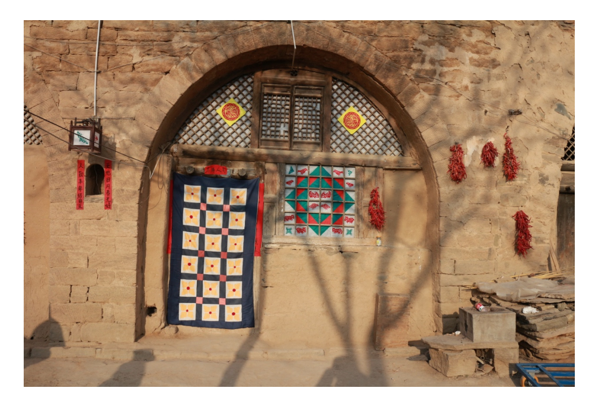
Figure 2. Ornaments hung on the doors of houses in northern Shaanxi during the Spring Festival